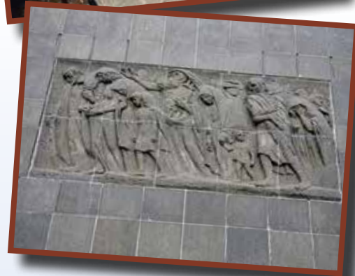
Top to bottom: A memorial, at the Jewish Cemetery in Warsaw, to the children who died during the Holocaust; mass graves in Warsaw where thousands of Jewish Holocaust victims were buried; and a memorial in front of the new Museum of Polish Jewry shows Moses leading the Polish Jews to the promised land.