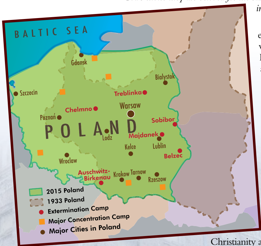
A map showing Poland's boundaries before and after the war. It also shows the locations of concentration camps. In addition to these, there were numerous labor camps and other facilities where people were detained and treated miserably.

There are less than 10,000 Jewish people living in Poland today—compared to a