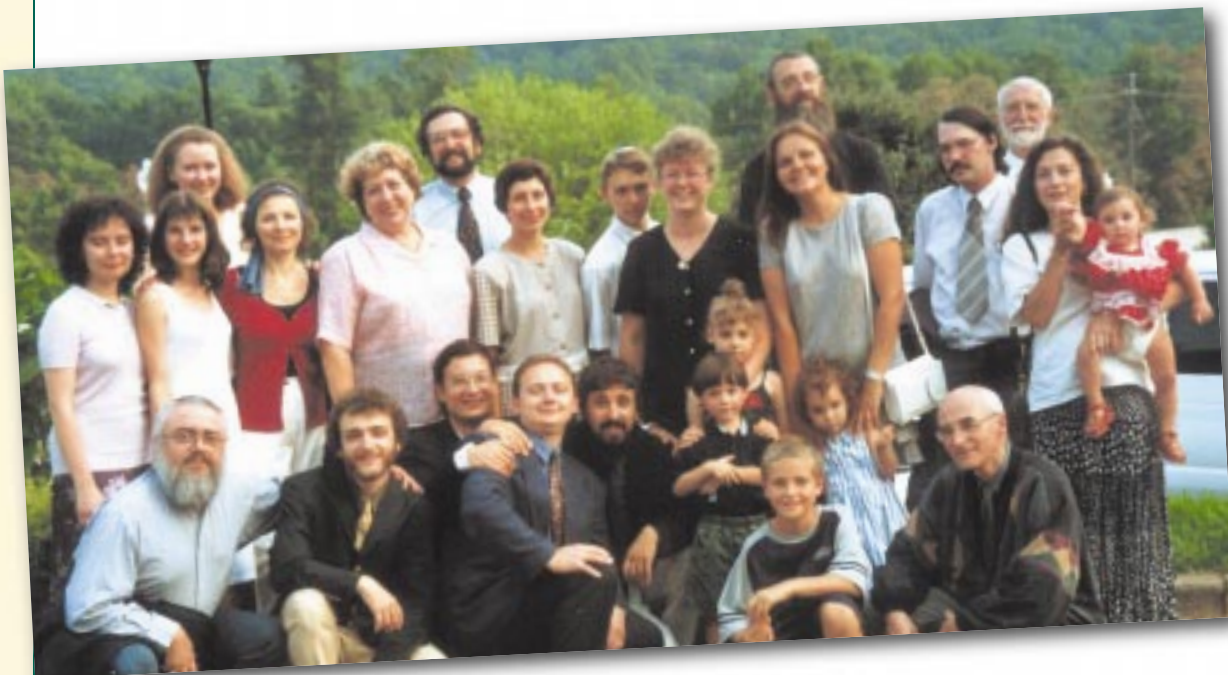
Left: Chosen People Ministries Russian staff members who are serving other Russian Jewish believers around the world