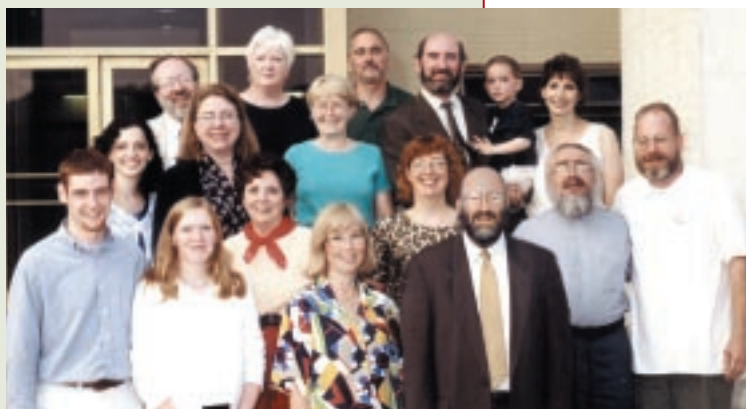
Our Canadian staff

Many of our readers are aware of a longstanding court battle in which Chosen People Ministries has been