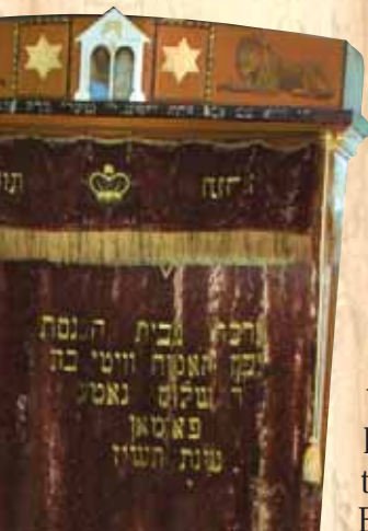
A synagogue in Birobidzhan