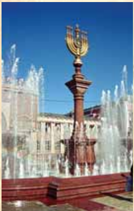
Birobidzhan's city square

The Jewish people have a long history in the lands of the former Soviet Union, perhaps even to the end of the Babylonian Captivity (539 BC) and certainly to the period before Jesus. From the 12th century onward, the Russian Jewish