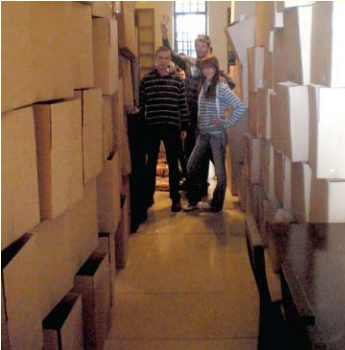
Boxes of supplies were stacked to the ceiling in the Jerusalem Messianic Center. A team of young people from Australia helped to deliver them to Sderot.