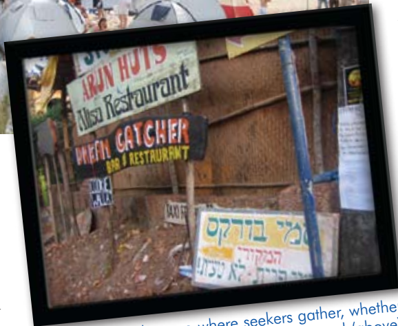
Our staff members go where seekers gather, whether at festivals like the one held in April in Israel (above) or in the Goa region of India (below).