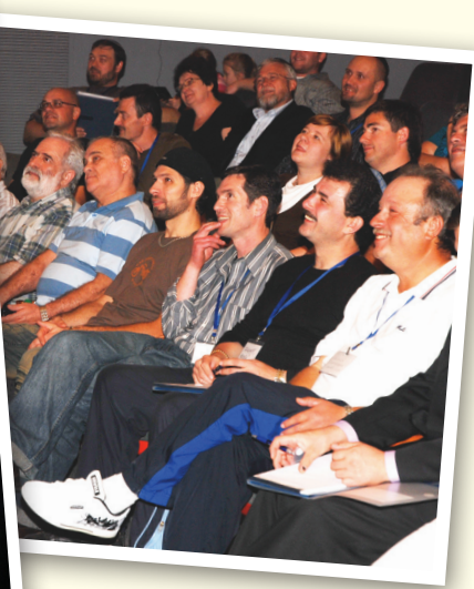
Second International Conference on Russian Jewish Evangelism