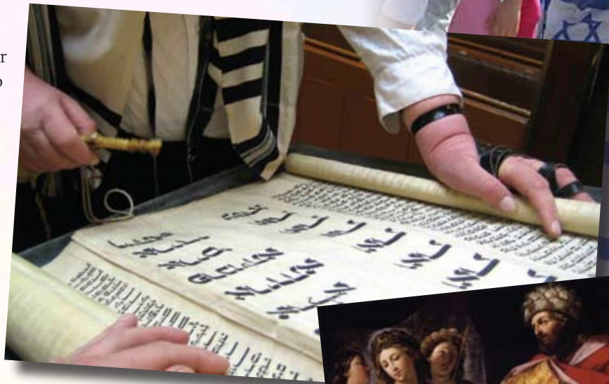
Reading the megillah; a Purim parade in Israel; artist's illustration of the biblical story of Queen Esther (right).