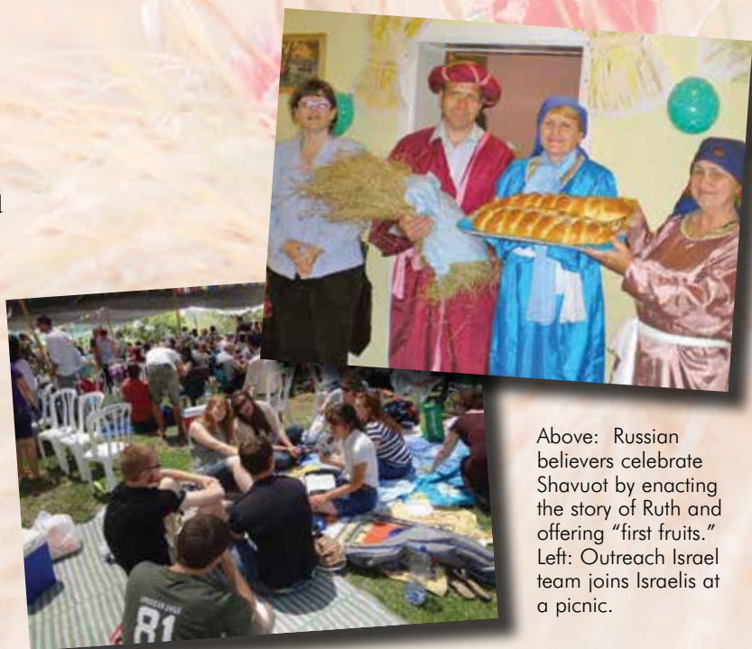
Above: Russian believers celebrate Shavuot by enacting the story of Ruth and offering "first fruits." Left: Outreach Israel team joins Israelis at a picnic.