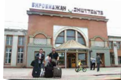
Ministry to Bukharan Jews - continued from page 4

It is our vision to establish a Messianic Center in Birobidzhan that would be a place of ministry to disabled, disadvantaged and homeless Jewish people, as well as a worship center for Jewish believers in Yeshua. We ask you to please pray for the ongoing ministry in Birobidzhan and the rest of the region.”