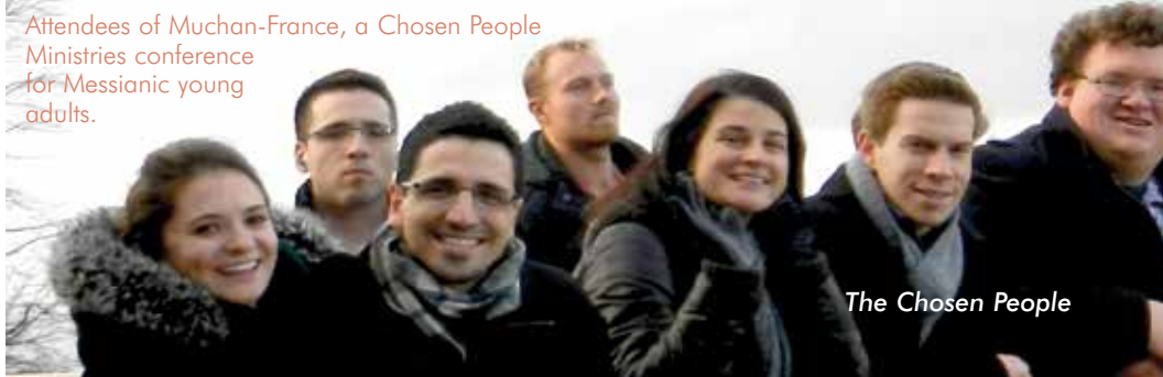
The Chosen People