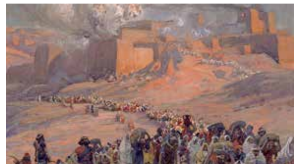
The Flight of the Prisoners by Jacques Joseph Tissot. c. 1896-1902, Jewish Museum, New York, NY

The remainder of this section is a description of how helpless Israel would be against the invading forces. Micah's hometown, Moresheth-Gath, would be taken captive, and the royal family would have to flee in terror to Adullam in order to escape, just as David had to do. Ultimately, the people are told to mourn over the loss of their children by shaving their heads: "Make yourself bald and cut off your hair, because of the children of your delight" (v. 16). This section began with an echo of David's lament over the death of King Saul and ends with the name of the cave in which David hid from that same king. Though not specifically mentioned, King David plays an important part in Micah's lament.