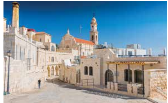
Bethlehem Old Town

Finally, Micah 5:5 says, “This One will be our peace.” He would come to bring us peace with God, as He would die on that horrible Roman cross to pay the penalty for our sins. That ultimately is the message of the season. “For today in the city of David there has been born for you a Savior, who is Christ the Lord” (Luke 2:11).