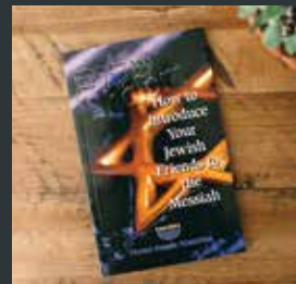
How to Introduce Your Jewish Friends to the Messiah • PRICE: $9.95 us

We often find it difficult to share the gospel with those whom we do not know well or feel we do not understand. This manual, How to Introduce your Jewish Friends to the Messiah , will help you reach Jewish people with the message of salvation!