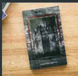
The Gospel in the Passover • PRICE: $14.95 us

Do you have questions about the meaning of life and spirituality? Maybe it is time to go right to the source and rethink your relationship with the Creator? Isaiah 53 Explained will help start your personal pilgrimage and introduce you to a chapter in the Scriptures that has the potential to revolutionize your life! Isaiah 53 Explained makes the story of the Bible understandable, practically and simply explaining how you can have a soul-satisfying relationship with God and revealing the surprising key that makes this relationship possible.