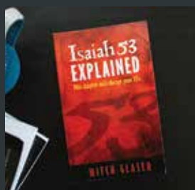
Isaiah 53 Explained • PRICE: $12.95 us