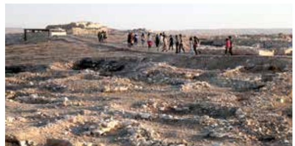
Settlement ruins in Israel

The Israelites had set the boundaries between some land parcels by casting lots. Joshua 14:1–2 is an example of this. No one would remain in the land who could do this in the assembly of the Lord, namely, Israel and Judah. The reason was that God would send His people into captivity and give their land to their captors. This is one of many examples of God's justice. The Israelites would reap what they had sown. They had taken land from their countrymen greedily and illegally, so God would take their land from them and let others occupy it.