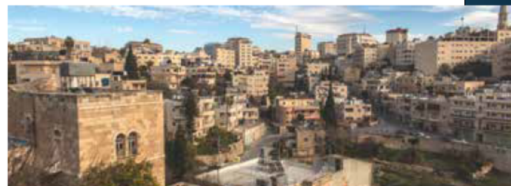
The modern city of Bethlehem.

Micah wrote in 5:4, this messianic king " will arise and shepherd [God's] flock [Israel] in the strength of the Lord " and in His " majesty ," which is certainly in harmony with His character. Contrast this glorious future with the failure of Israel's leaders in Micah's day. Earlier, Micah had rebuked Israel's leaders (Mic 3:1-3), claiming they do not know justice and " hate good and love evil ." The pastoral role of Israel's messianic king who leads and cares for His people is in view in Mic 5:4. His greatness ultimately will guarantee their security.