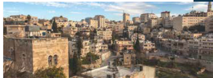
The modern city of Bethlehem.

Micah wrote in 5:4, this messianic king " will arise and shepherd [God's] flock [Israel] in the strength of the Lord " and in His " majesty ," which is certainly in harmony with His character. Contrast this glorious future with the failure of Israel's leaders in Micah's day. Earlier, Micah had rebuked Israel's leaders (Mic 3:1-3), claiming they do not know justice and " hate good and love evil ." The pastoral role of Israel's messianic king who leads and cares for His people is in view in Mic 5:4. His greatness ultimately will guarantee their security.